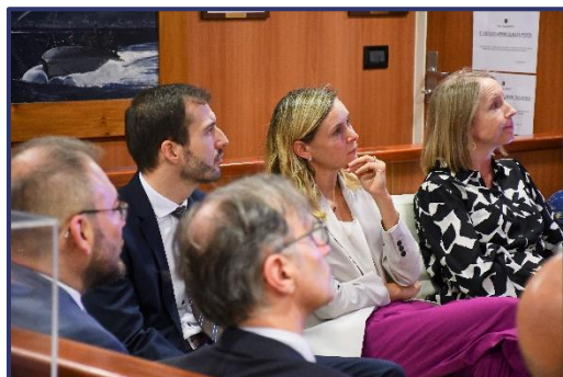
Figure 5: The Ambassadors of Austria, Romania, Hungary, France and the Netherlands

On the Italian frigate Luigi Rizzo , we had the opportunity to host Ambassadors and high representatives of EU in Muscat. It is of great importance to share our knowledge with regional and European actors. We presented our objectives, goals and our way ahead. The head of the Naval Cooperation and Guidance for Shipping joined the