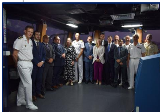
Figure 7: Invitees of the ambassador's event gathered on the bridge of ITS Luigi Rizzo

EMASoH Headquarters telephone watch (24/7): +39 0187024 (DIAL 2 FOR ENGLISH) 7566903