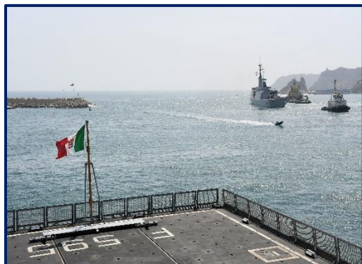
Figure 6: French frigate FS Surcouf leaving the port of Muscat after waving goodbye to ITS Luigi Rizzo