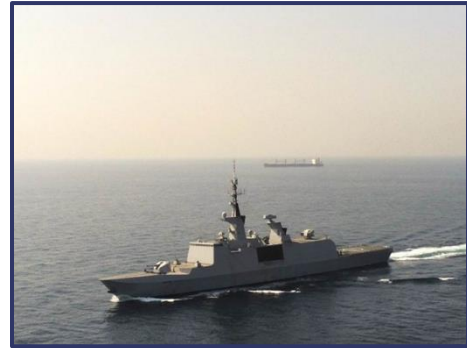
Figure 7: the FS Surcouf performing a transit with a merchant vessel in the Strait of Hormuz

After the seizures of the tankers in the Gulf Area, we increased our presence in the Strait of Hormuz. When another merchant vessel was presumably harassed, both Surcouf and Rizzo kept a strategic watch on merchant vessels transiting the Strait.