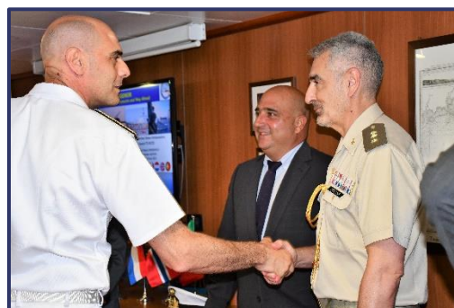
Figure 4: The Force Commander (left) receives the Spanish Defense Attaché COL JOSE-MARIA BONASTRE

interests for our operation as well as the type of monitoring we do at EMASoH. The Ambassadors of Italy, France, The Netherlands, Austria, Cyprus, Romania and Hungary and the Defence Attachés of Italy, France and Spain attended the presentation. This presentation helped to significantly raise the awareness and the understanding of the operation.