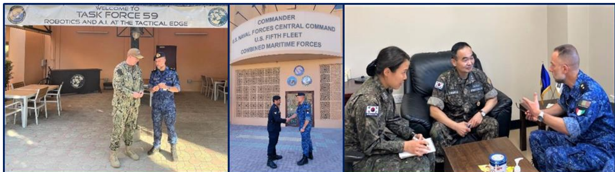
Figure 2: MANAMA (Bahrain) L-R visits to; CO of TF 59, Kuwait Assistant to the CO of CMF for regional integration, Korean Commander of TF151.

These visits gave the opportunity to better understand maritime security synergies and explore the possible potential for EMASoH to develop its maritime regional awareness. One of the aims of EMASoH is to promote the dialogue among the entire maritime cluster and keep an inclusive approach towards all actors in the region. The successful visits in Riyadh and Bahrain demonstrate these aims once again.