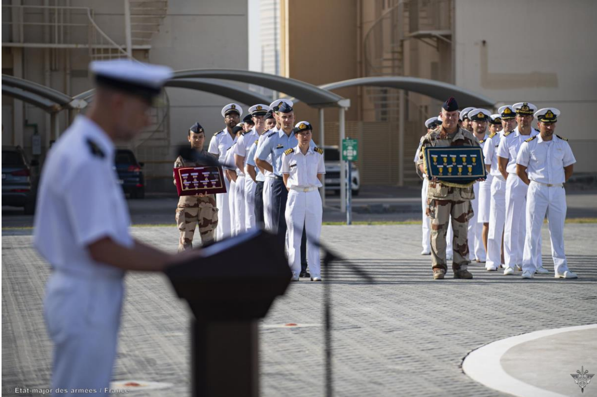
Figure 2: Rear Admiral Renaud Flamant addressing the staff of the Force Headquarters, who received the Belgian and French commemorative medals in the ceremony.