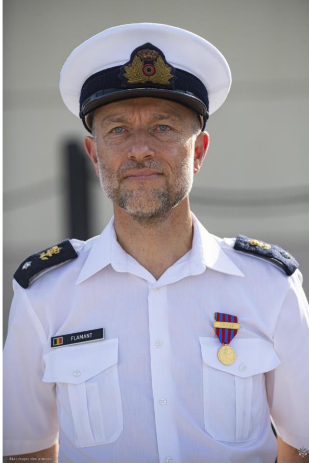
Figure 1: Leaving Force Commander Rear Admiral Renaud Flamant decorated with the French Commemorative Medal engraved with "Hormuz".