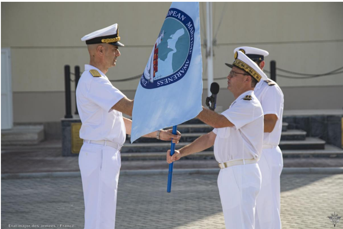
Figure 3: The new Force Commander Rear Admiral Mauro Panebianco receiving the tactical command of Task Force AGENOR from the Operation Commander Vice Admiral Emmanuel Slaars.