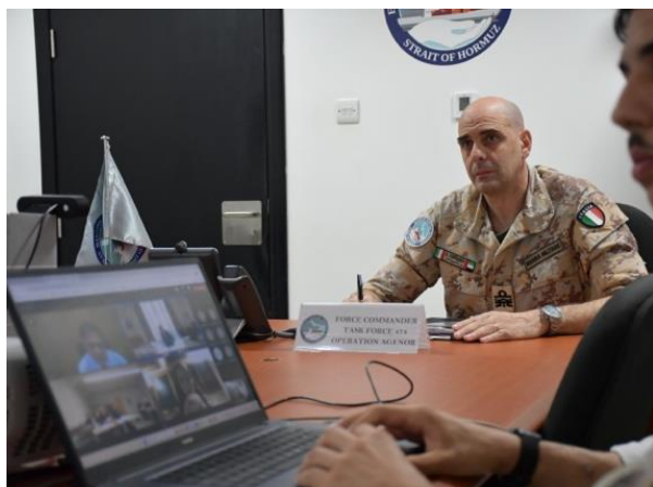
Figure 3 - EMASoH VTC ECSA Maritime Security Working Group