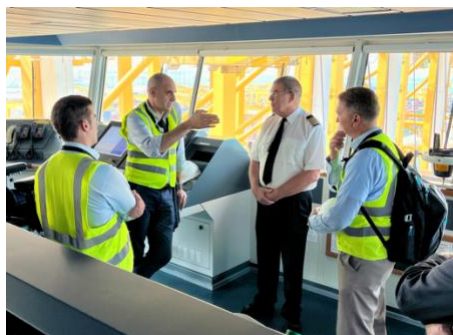
Figure 1 – Visit Emma Maersk

EMASoH was invited to Dubai to visit Emma Maersk, a vessel that once held the title of the largest container ship ever built. Our team had the privilege of meeting the Captain and the dedicated crew, engaging in insightful discussions about their activities in the Gulf region.