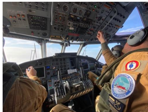
Figure 2 – Flight Maritime Patrol Aircraft

This airborne component extends our reach and enhances our capacity to monitor and analyse maritime activities from above. The crew's observations and data collection contribute significantly to the comprehensive understanding of the maritime landscape in the region.