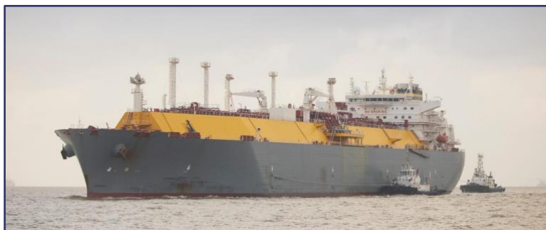
Figure 6 - An LNG (Liquefied Natural Gas) carrier that operates for Shell

In September we also spoke to the maritime security manager of Shell during a VTC. Shell, being one of the world's largest multinational energy and petrochemical companies, is an important stakeholder within the Gulf region. Many of the oil tankers that cross the Strait of Hormuz daily are directly or indirectly linked to the company.