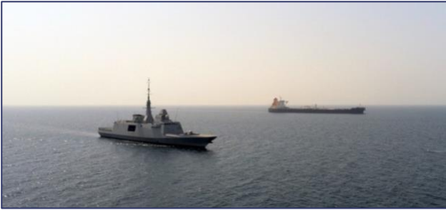
Figure 3 – FS Languedoc during accompaniment with merchant vessel

Languedoc provided a total of 19 accompaniments, in- and outbound of the Strait of Hormuz. This raised the total number of EMASOH accompaniments performed this year to more than 160 and more than 120 since early june.