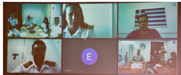
Figure 2 – Greece's Ministry of Foreign Affairs, Joint Defence Staff and Hellenic Coastguard during the VTC

On September 11 th we met by VTC with several Greek authorities in the maritime domain. Included were Greece's Ministry of Foreign Affairs, the Joint Defence Staff and the Hellenic Coastguard. As the Greek merchant shipping community is one of the largest within the EMASOH ships of Interest group, we re-emphasized that it is