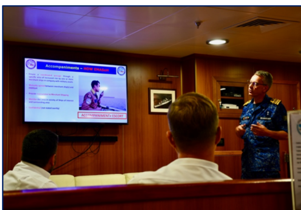
Fig.1 - NCAGS presenting about the Voluntary Reporting Scheme (VRS)

Reporting Scheme (VRS) works and how we aim to reassure merchant vessels transiting through the area.