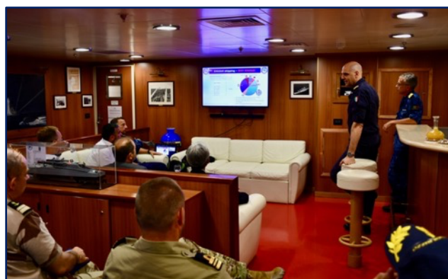
Fig.2 – The EMASoH presentation on board of ITS Luigi Rizzo

Giving these presentations allows us to inform the merchant operators about Operation AGENOR, and the way in which NCAGS (Naval Coordination And Guidance to Shipping) aims to cooperate with the merchant vessels in the Gulf region and Strait of Hormuz. For example, we explain how the Voluntary