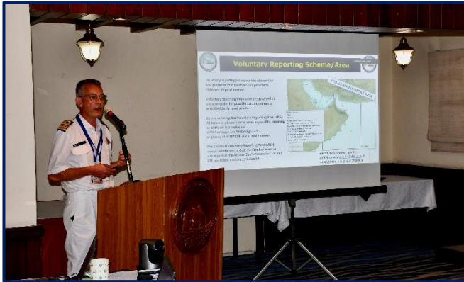
Figure 3. The Head of NCAGS explains about our Voluntary Reporting Scheme (VRS)

On July 6 th , EMASoH-AGENOR attended the Maritime Information Exchange Vessel Operators' Meeting (MIEVOM) conference at the Dubai International Seafarers Centre. The event, hosted by the UKMTO (Royal Navy), offered a chance to several stakeholders within the maritime sector to share their experience and knowledge of their endeavours in the maritime domain.