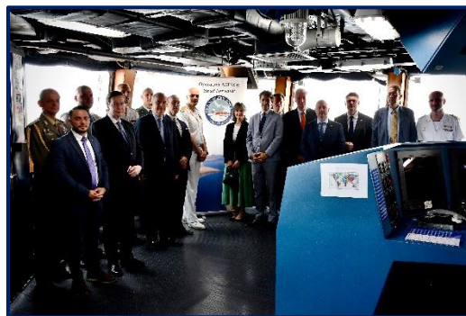
Figure 2. Group picture during the Ambassadors event on the bridge of ITS Luigi Rizzo

We had a high attendance of several key leaders of European countries. There were the ambassadors to Belgium, Greece, Italy, Romania and Spain and also deputy heads of missions and chargés d'affaires and defense attachés of: The Netherlands, Poland, Sweden, Italy, Germany, France and the European Union. The meeting was a valuable and fruitful one, and we look forward to similar events that we can host in the future.