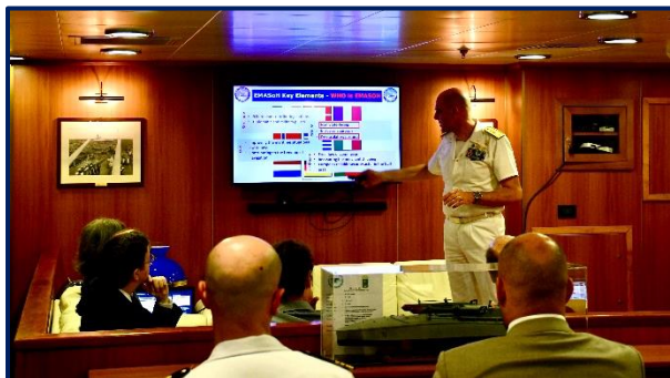
Figure 1. Force Commander RADM PANEBIANCO presenting EMASoH and AGENOR to attendees

During the scheduled port visit to Doha, the Italian ship ITS Luigi Rizzo - current flagship of EMASoH military Operation AGENOR - invited several ambassadors, defense attachés and officials onboard. Among them were representatives of countries participating in EMASoH, as well as delegates from other countries interested in the ongoing European-led Maritime Awareness in the Strait of Hormuz.