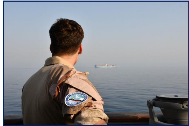
Figure 6. An accompanied ship seen from ITS Luigi Rizzo