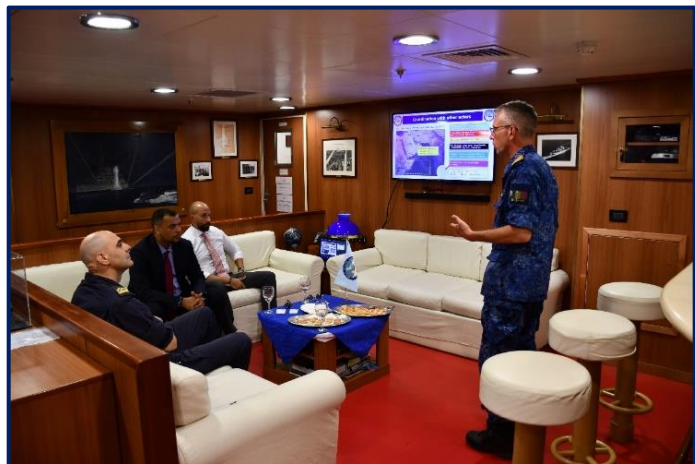
Figure 4. The Head of NCAGS explains about our Voluntary Reporting Scheme (VRS)

It was a great opportunity for us to have meaningful conversations with one of our stakeholders and gain valuable insights with regard to the freedom of navigation in our area of operation, as well as merchant vessel owner's general security concerns.