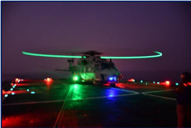
Figure 5. The NH-90 helicopter during a night flight

In the month of July EMASoH continued to conduct its core activities by accompanying multiple merchant vessels during their passage through the Strait of Hormuz and performing EMMA calls (EMASoH Manoeuvres). EMASoH currently has several assets to use for this very purpose: the flagship, Italian frigate ITS Luigi Rizzo and its NH-90 helicopter, a French Maritime Patrol Aircraft (MPA) and an Italian Unmanned Aerial Vehicle (UAV). Using these assets, we reassure merchant shipping and contribute to their safe passage of the Strait of Hormuz and its approaches.