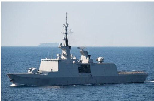
Figure 2 – French Navy ship committed in the Strait of Hormuz

Immediately, France deployed a French Naval Ship (FNS) under AGENOR command in the Strait of Hormuz, to contribute to maritime security and freedom of navigation. The FNS has accompanied two ships, MSC OPERA and MSC BERANGERE in a single transit, during her brief period assigned to operation Agenor of the European initiative European-led Maritime Awareness in the Strait of Hormuz (EMASoH).