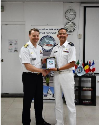
Figure 8 – Commodore Gimmingrud receiving thanks of Force Commander Colmant

Force Commander Rear Admiral Colmant met Commodore Gimmingrud, Chief of the Norwegian Fleet, showing shared commitment to the freedom of navigation.