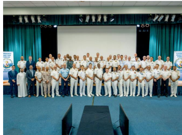
Figure 7 – Group Photo Maritime Security Conference

During the conference, Operational Commander Vice Admiral Slaars briefed the audience about the achievements of EMASoH, elaborating on EMASoH's commitment and contributions to freedom of navigation and maritime security in the Gulf region.