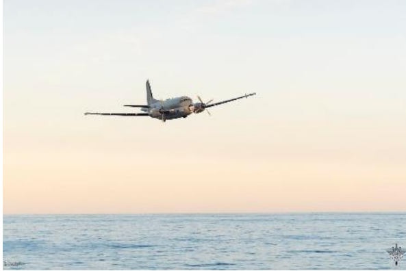
Figure 5 –MPA Atlantique 2 in the Strait of Hormuz

In April two assets were assigned to directly support EMASoH Operation AGENOR. These assets were the French Maritime Patrol Aircraft (MPA) the Atlantique 2 and a French Navy Light Frigate.