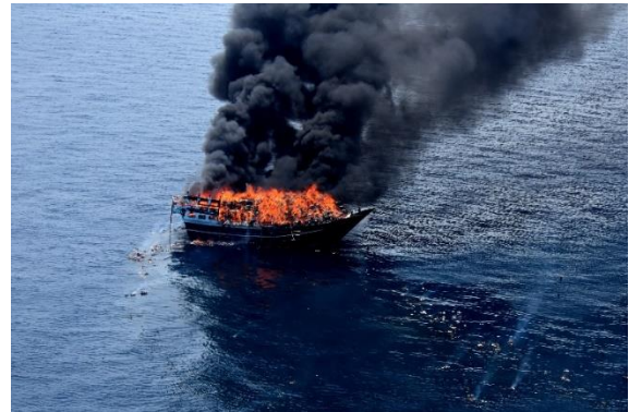
Figure 3- Dhow vessel

EMASoH swiftly informed the Iranian authorities, who dispatched a rescue boat to start a Rescue operation. The Iranian authorities thanked EMASoH for our assistance and our aircraft resumed its patrol. Fortunately, the crew was rescued.