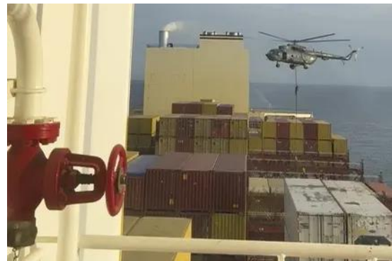
Figure 1 – Boarding of the MSC Aries

The boarding, in breach of international law, happened while the merchant vessel was sailing in international waters in the Gulf of Oman. The MSC Aries was at the time heading to India according to the destination transmitted by her Automatic Identification System (AIS).