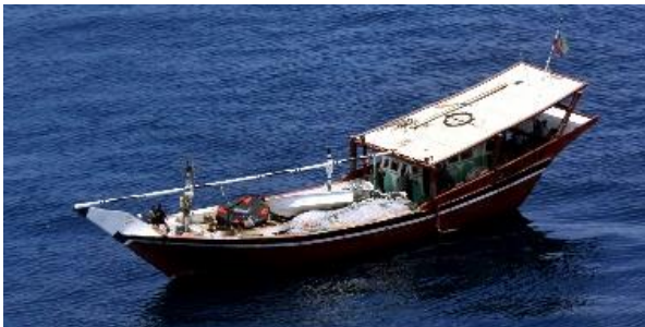
Figure 4- Fish boat of the type dhow, the type that was on fire during the emergency

It is a seaman's duty to help people in need at sea regardless of their nationality, status, or the circumstances in which people in distress are found at sea. This is in accordance with the applicable Maritime Law and Conventions, such as the 1979 SAR Convention. And beyond, EMASoH reaction underlines once again the de-escalatory DNA of our operation in the region.