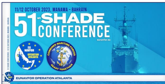
Figure 1 – Poster for 51st SHADE conference