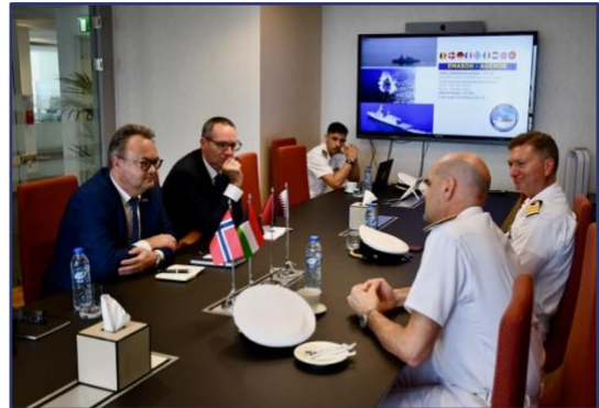
Figure 2 – Visit to the Norwegian Embassy

We would like to thank His Excellency and staff for having hosted us at the Norwegian embassy. It was a fruitful visit, and a valuable opportunity to share knowledge.